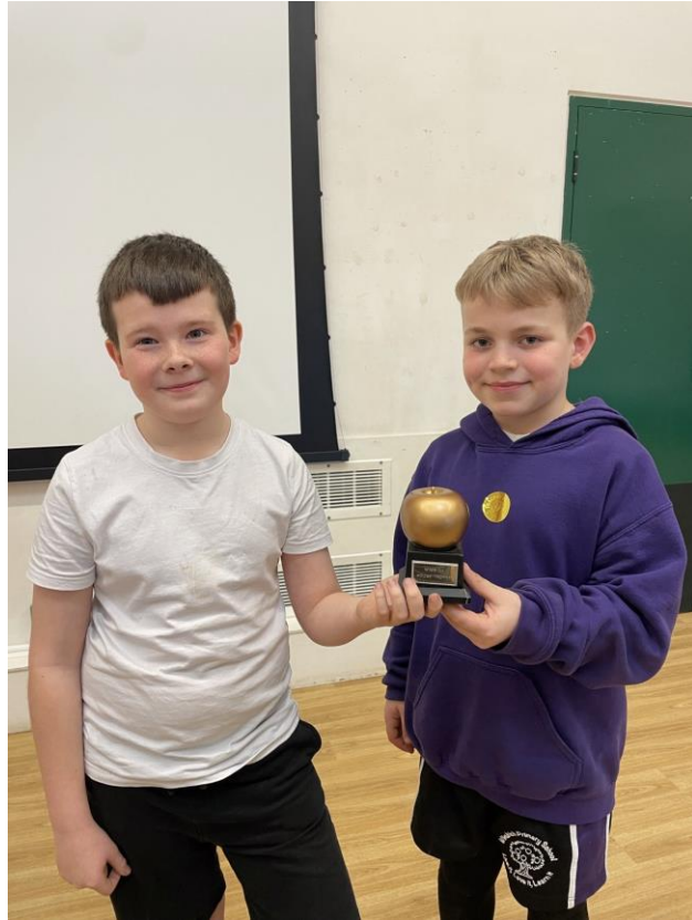
2 - Red and Green team were joint winners with 28 points.