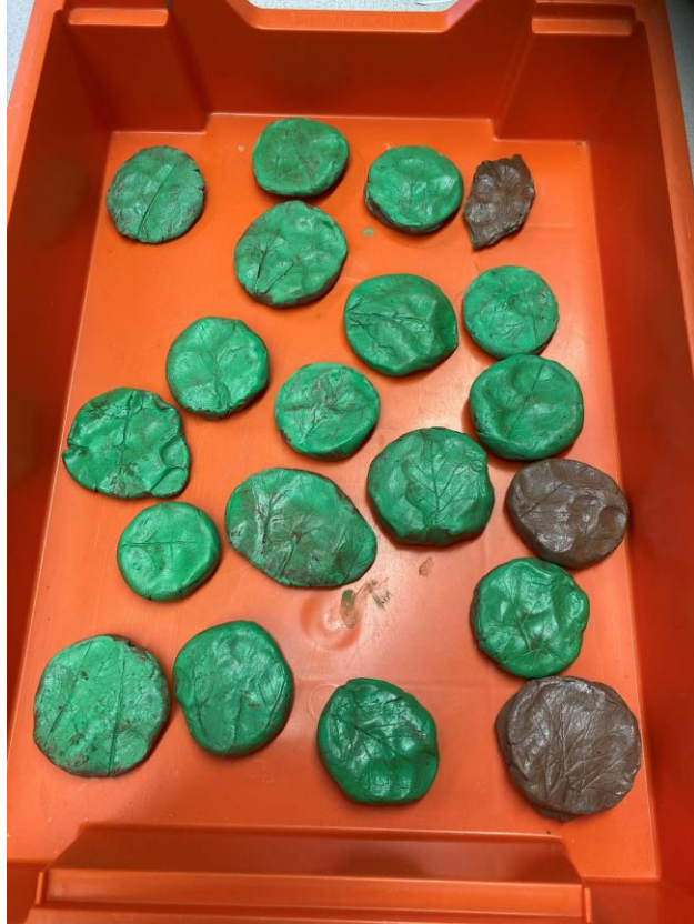
1 - Forest School - Leaf prints using clay